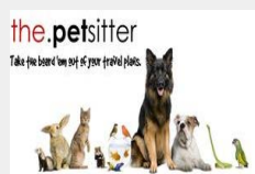
BEST Pet Services